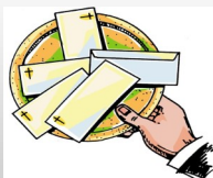
Amounts redacted per diocesan policy.

BEFORE MASS, spend time speaking to God, DURING MASS, listen as God speaks to you, AFTER MASS, speak with friends and neighbors